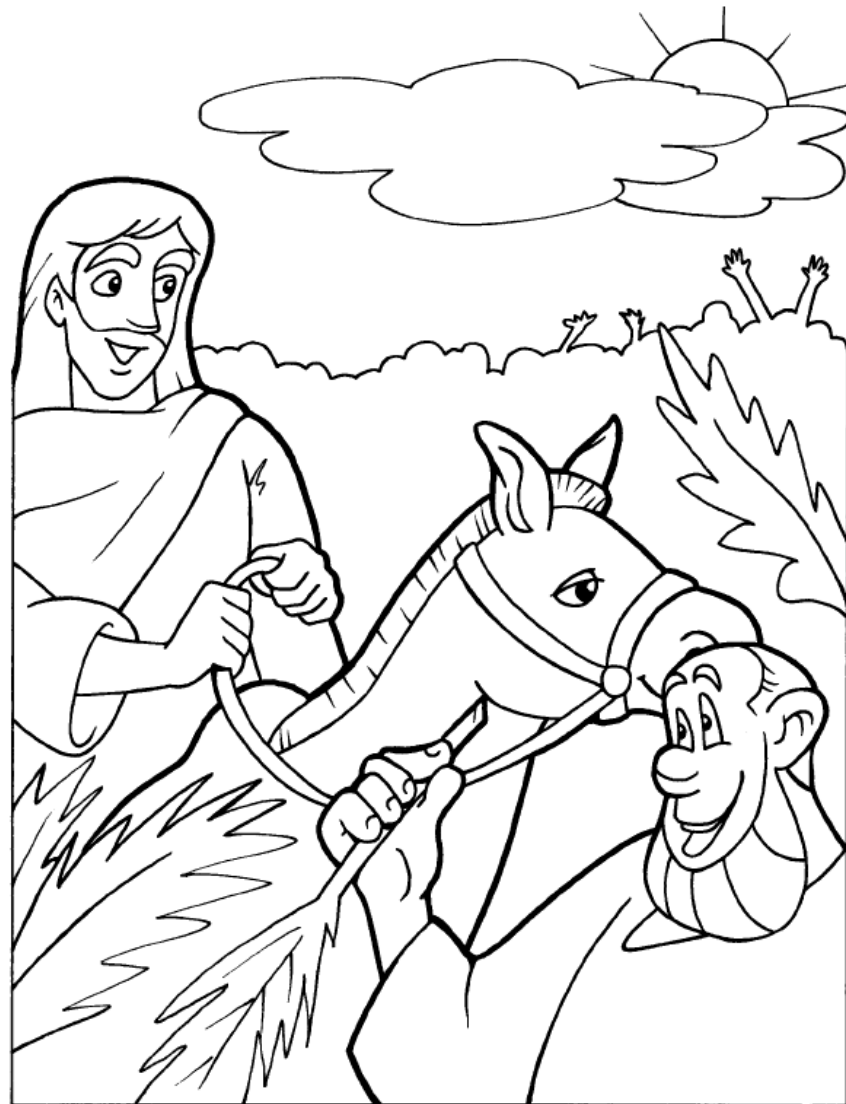
The Triumphal Entry