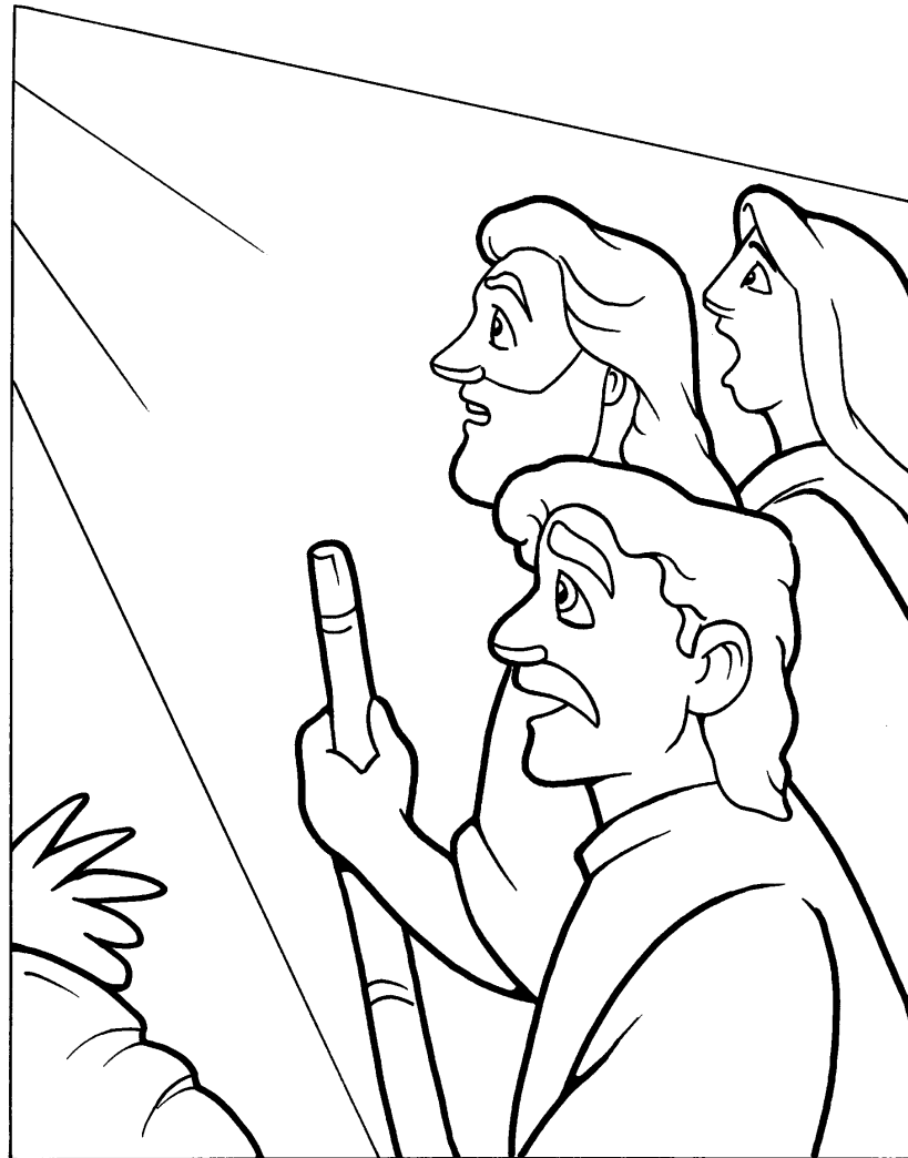
The Transfiguration Mark 9:2-9